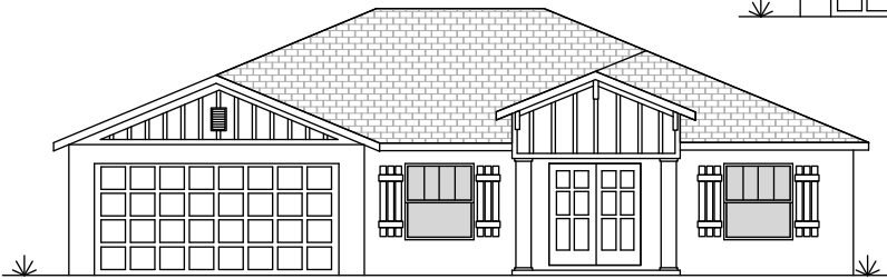
Optional Elevation "C"