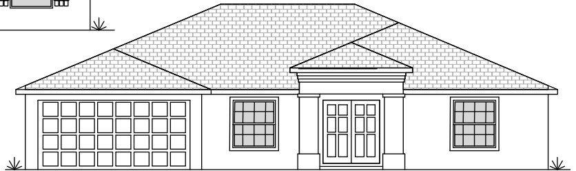
Standard Elevation "A"